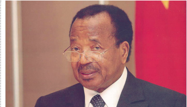
President of the Republic of Cameroon, H.E. Paul Biya EMBASSY OF CAMEROON

As we head toward the Olympic and Paralympic games, I will end this message by hailing our multidimensional collaboration with Oita Prefecture. Despite the critical time we are all going through, I am convinced that Cameroon’s Olympic team will spend a safe and joyful stay at the city of Hita, and I warmly thank the governor of Oita and the mayor of Hita for their support.