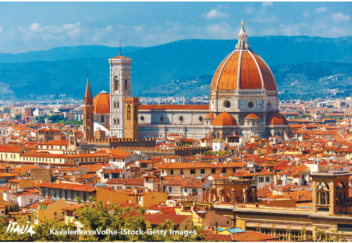
2021 will mark the 700th anniversary of the death of the poet and philosopher Dante Alighieri, the father of the Italian language. Dante was born in Florence (left) in 1265.