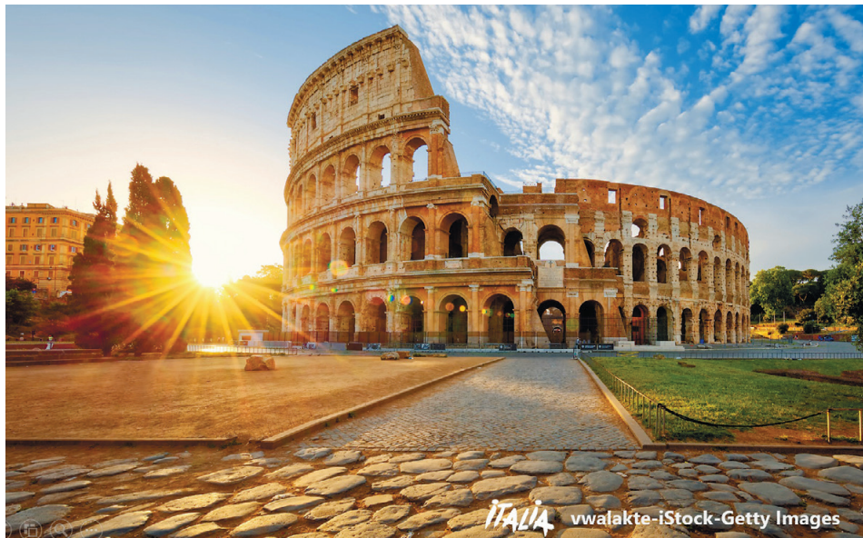
Italy, this year's president of the Group of 20, will host the forum's final summit in Rome at the end of October.