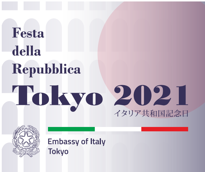
This content was compiled in collaboration with the embassy. The views expressed here do not necessarily reflect those of the newspaper.