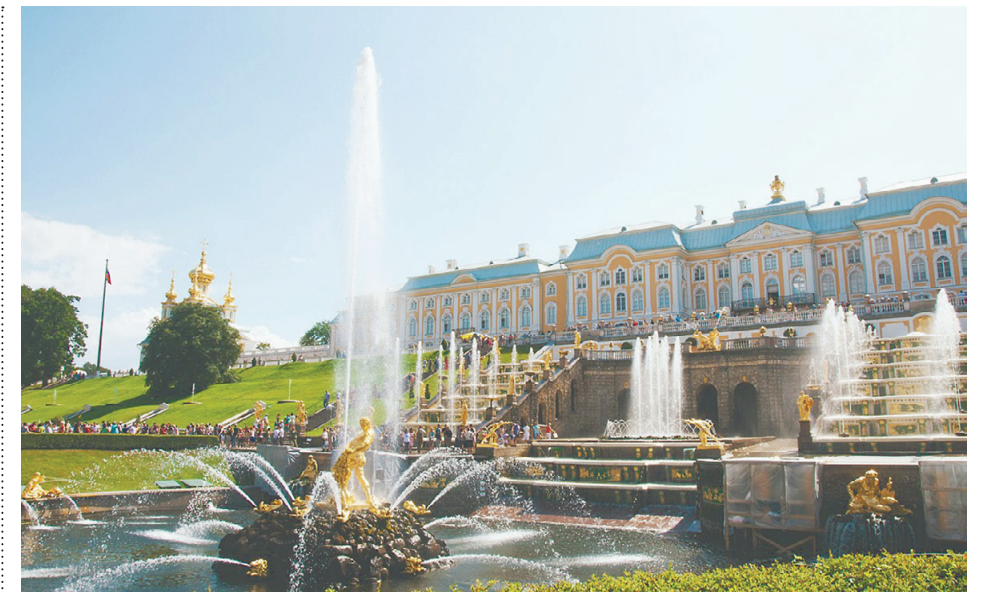
The Samson Fountain sits in front of Peterhof Palace in Saint Petersburg. EMBASSY OF THE RUSSIAN FEDERATION

This content was compiled in collaboration with the embassy. The views expressed here do not necessarily reflect those of the newspaper.