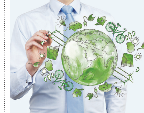
With the slogan "Green, Creative, Smart," Slovenia is focusing on the so-called green economy and sustainable development to become a more advanced, low-carbon society.

opportunties to strenghten our partnership to face the challenges of how to use technology for the benefit of people, as this is ultimately the core of all our efforts for a better tomorrow.