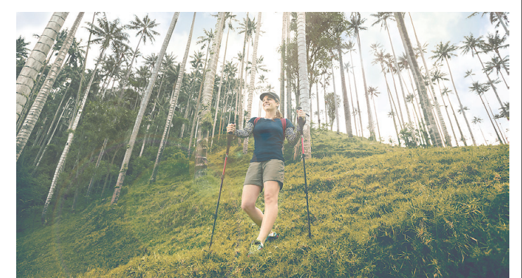
The wax palm, Colombia's national tree, thrives in the Cocora Valley in the town of Salento, growing up to 60 meters high.