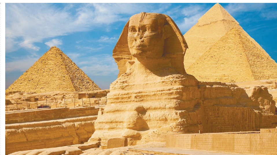
The Sphinx stands before the pyramids in Giza.

The ongoing schemes of cooperation also include Japanese support to the Grand Egyptian Museum, which is