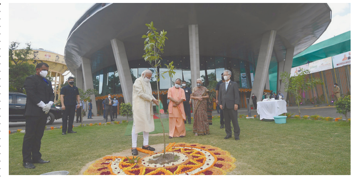
Prime Minister Narendra Modi plants a sapling at the inauguration of the Varanasi International Cooperation and Convention Centre in the state of Uttar Pradesh on July 15.

As India approaches the momentous milestone of its 75th year of independence, it envisions itself as a reinvigorated atmanirbhar (self-reliant) nation. 2022 will mark the 70th anniversary of the establishment of India-Japan diplomatic relations, and I am confident that the India-Japan partnership will continue to grow from strength to strength based on increased people-to-people exchanges.