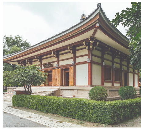
Akshardham Temple in Delhi opened in 2005. Above: Built in 1972, Indosan Nipponji temple was designed to look like a Japanese shrine.