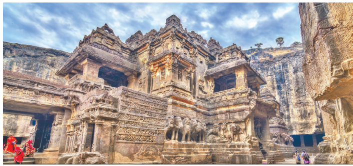
The Kailasa Temple in Maharashtra is a UNESCO World Heritage Site. EMBASSY OF INDIA

This content was compiled in collaboration with the embassy. The views expressed here do not necessarily reflect those of the newspaper.