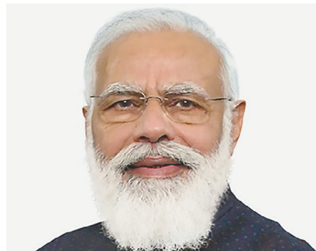
Prime Minister Narendra Modi EMBASSY OF INDIA

The COVID-19 pandemic has posed challenges as well as provided new opportunities globally. India has taken proactive steps to counter the pandemic and as a result, the cumulative number of COVID-19 infections as well as deaths per million people is below that of more than 100 countries. India has also contributed 66 million doses of vaccine directly or through the COVAX facility to