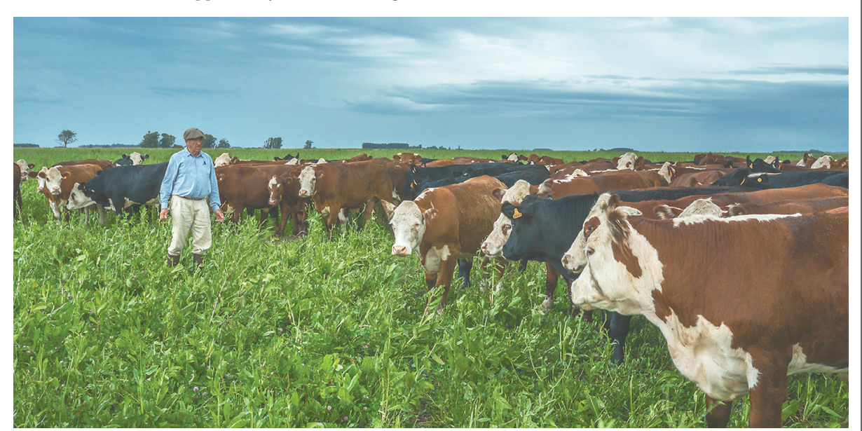
A Uruguayan farmer tends to his cattle.

Through these events, I hope that Japan and Uruguay will further strengthen bilateral relations in many aspects, such as politics, economics and culture.