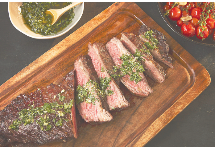
Traditional dish of Uruguayan beef INSTITUTO NACIONAL DE CARNES