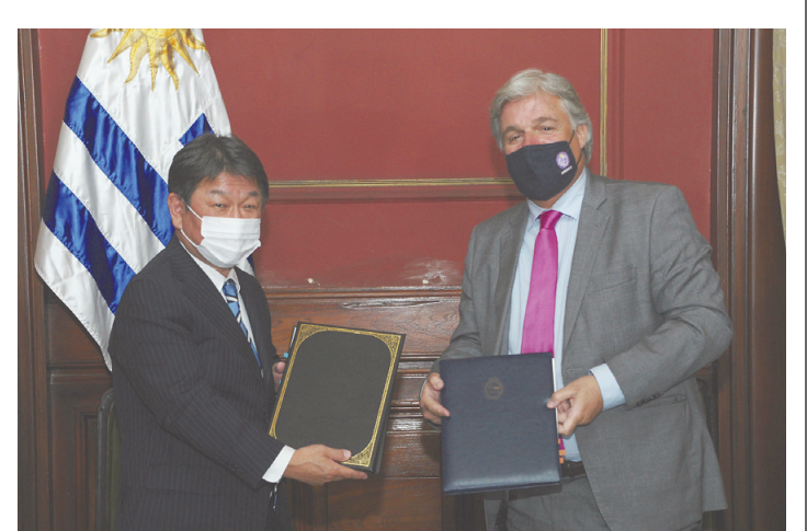
For eign\,Minister\,To shim its u\,Motegi\,and\,Uruguayan\,counterpart Francisco Bustillo sign the Customs Mutual Assistance Agreement in January.