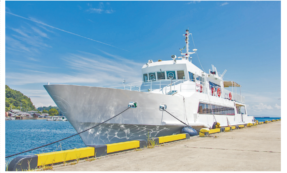
A 34-meter health-screening ship run by Peace Winds Japan, a nongovernmental organization, with funding from the Japanese government, will arrive in Palau to begin delivering kenshin (health-screening) services to remote islands by early 2022.