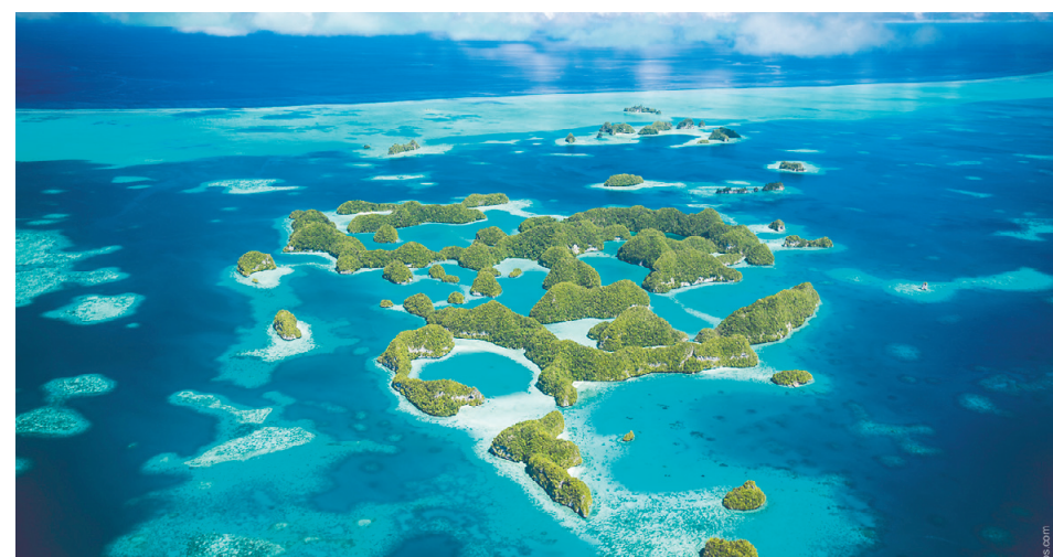
The Rock Islands Southern Lagoon is registered as a mixed UNESCO World Heritage Site. The limestone islands between Koror and Peleliu are among Palau's world-famous diving spots. DAVID KIRKLAND

Again, my warmest greetings with gratitude to the government and people of Japan for standing by our side over the past 27 years.