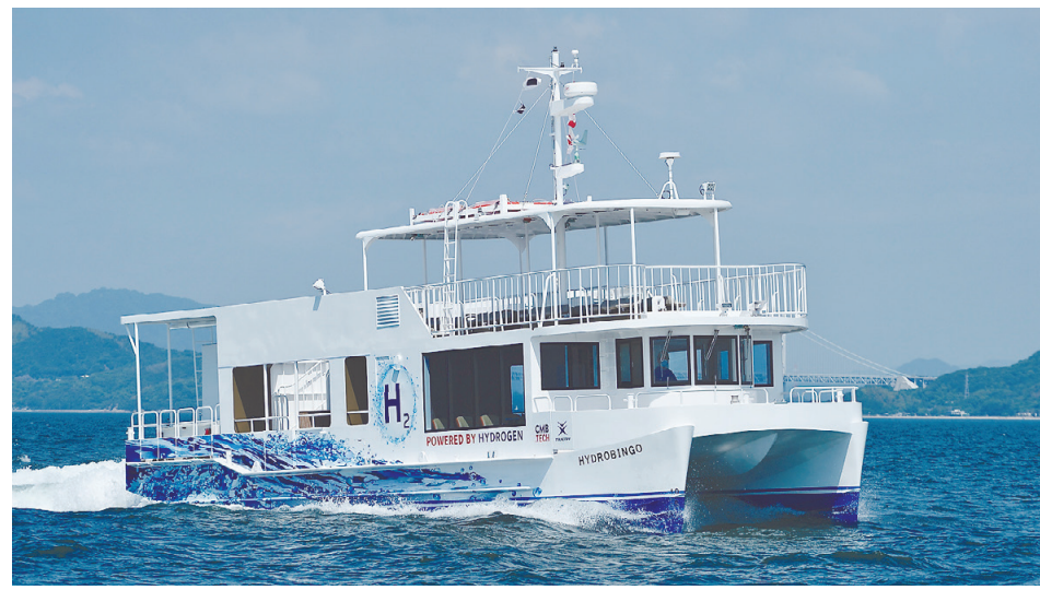
The HydroBingo is the world's first commercial ferry powered by both hydrogen and by diesel engines. This "eco-ship" reduces emissions of carbon dioxide and other harmful gases by up to 50% compared with conventional vessels.