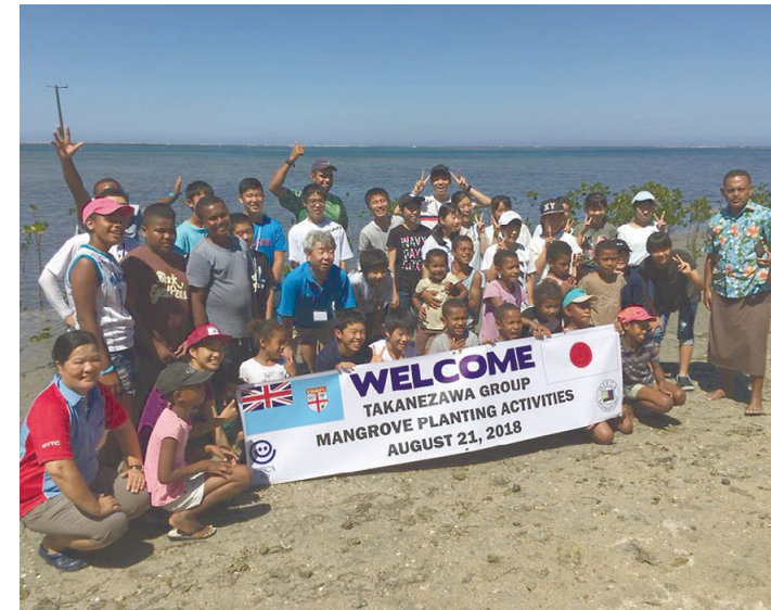
Students from Akutsu Junior High School and Kita Takanezawa Junior High School in Tochigi Prefecture pose after participating in a mangrove planting event in the town of Sigatoka during their visit to Fiji in August 2018.

I hope that the coronavirus pandemic will end, and life will return to normal soon. May God bless Fiji-Japan relations.